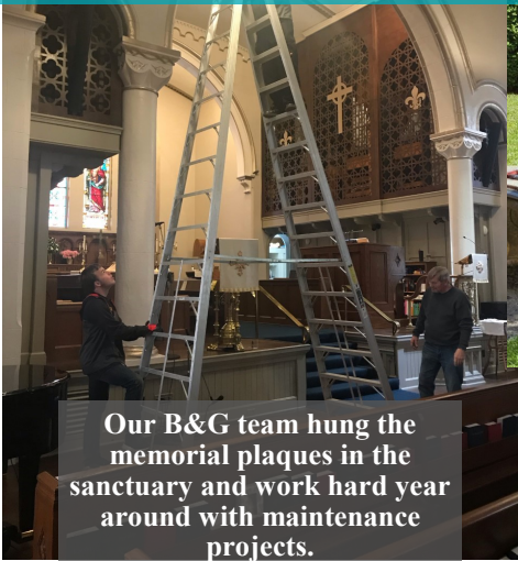
Our B&G team hung the memorial plaques in the sanctuary and work hard year around with maintenance projects.