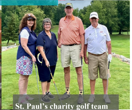
St. Paul's charity golf team