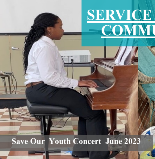
Save Our Youth Concert June 2023