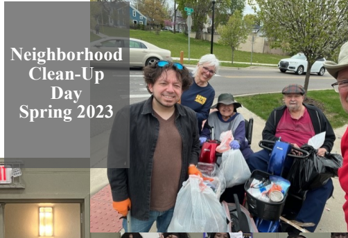
Neighborhood Clean-Up Day Spring 2023