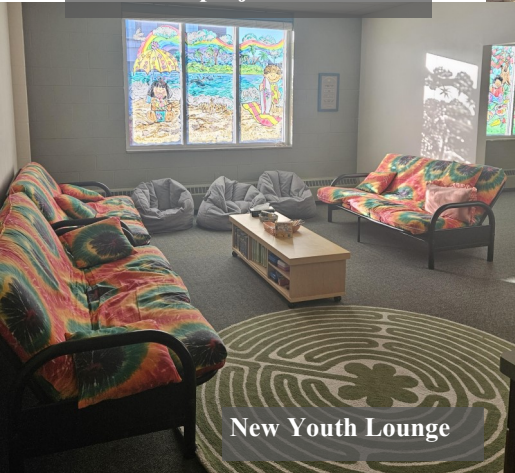
New Youth Lounge