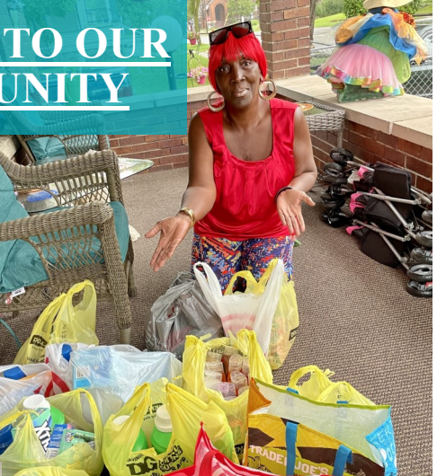
Mama Tutu Back to School collection August 2023