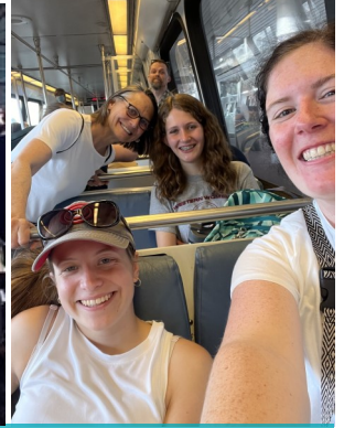
Episcopal Youth Event Summer 2023