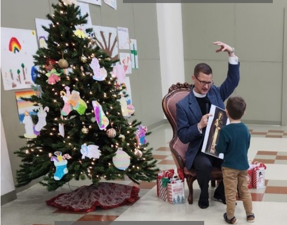
St. Nicholas Party