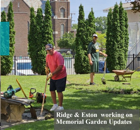
Ridge & Eston working on Memorial Garden Updates