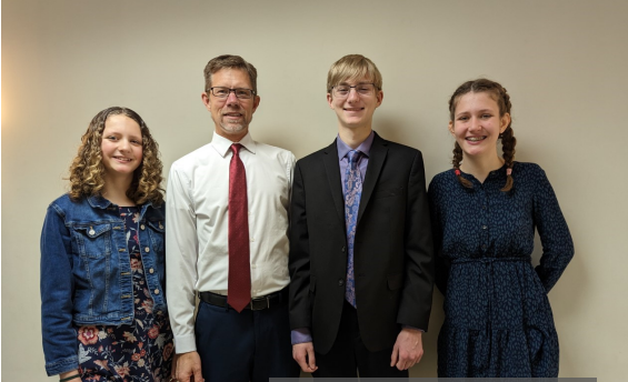
EDOMI Night Watch