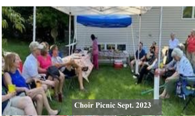
Choir Picnic Sept. 2023