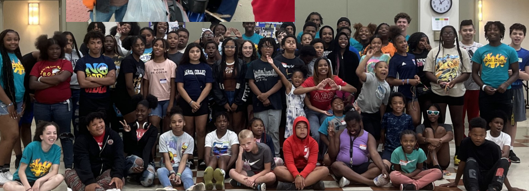
"Get Real" Youth Summer Program 2023