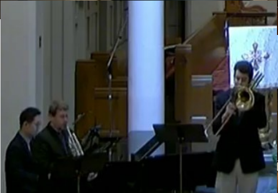
Guest Musicians The Kingsmen Trio Nov. 1, 2023