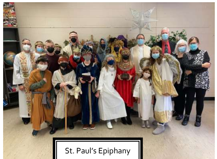
St. Paul's Epiphany Pageant 2022